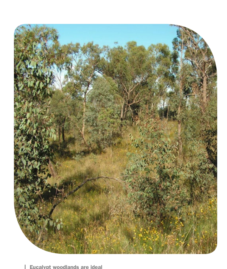
habitat for Squirrel Gliders.

Squirrel Glider habitat is often degraded and unlikely to sustain glider populations in the long term. Extensive clearing of native vegetation means that existing habitat has been fragmented into small "islands" that are not well connected. These small patches and the big distances between them will limit Squirrel Glider movement and reduce their opportunities for feeding and breeding.