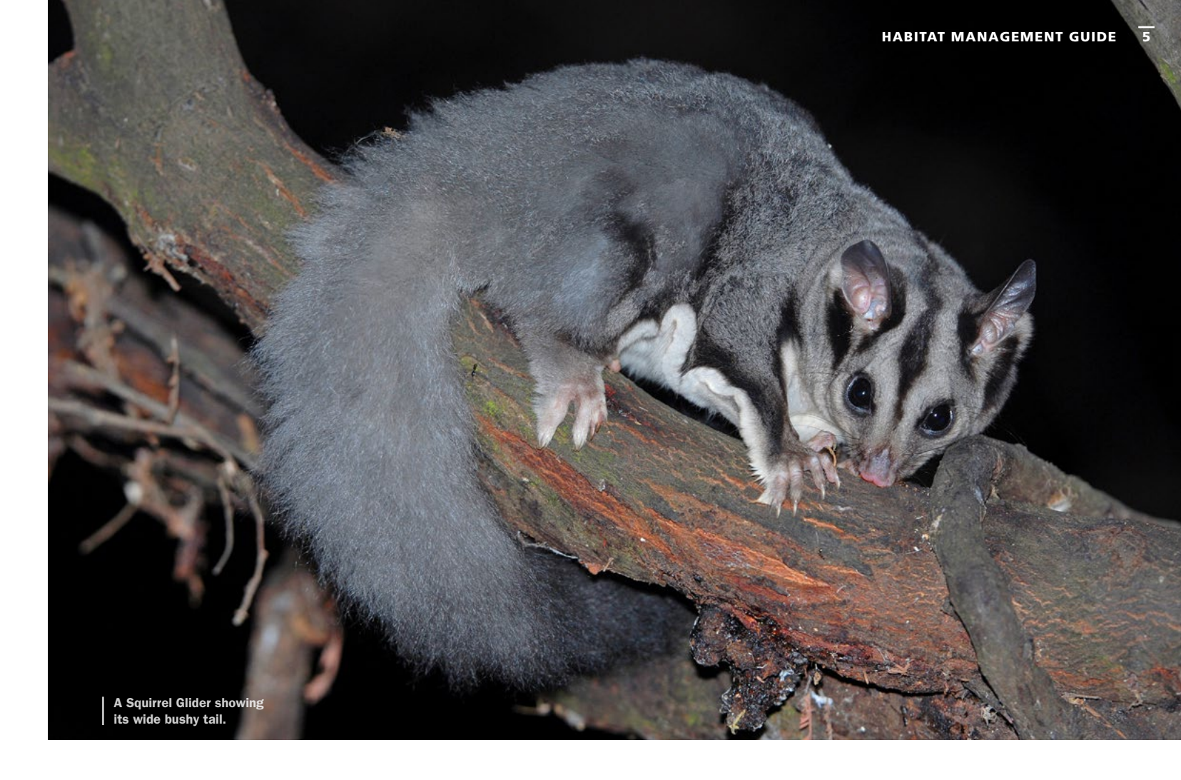
Squirrel Gliders have white to cream coloured belly fur.