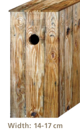
Height: 40-50 cm