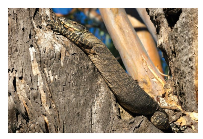
A Goanna: a natural predator of the Squirrel Glider