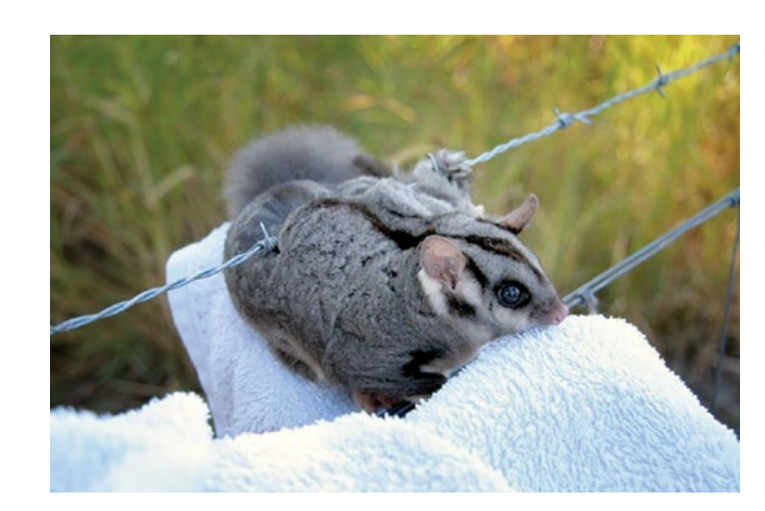
A Squirrel Glider caught in a barbed-wire fence.