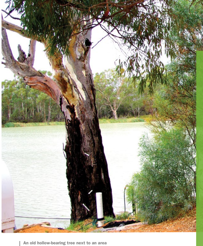
having revegetation works undertaken.

Hollows in trees take at least 100 years to form. Consequently, to have more hollowbearing trees in the future we need to be planting more trees now. Old hollow-bearing trees will not last forever so we need to start actively replacing this resource.