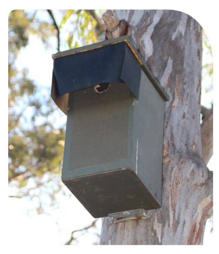
A nest box with a rubber baffle to deter Indian Mynas, an aggressive introduced bird species that competes for nesting hollows

If you are lucky enough to find a glider or other native animals in your box please don't touch or pat it. Gliders have very sharp teeth!