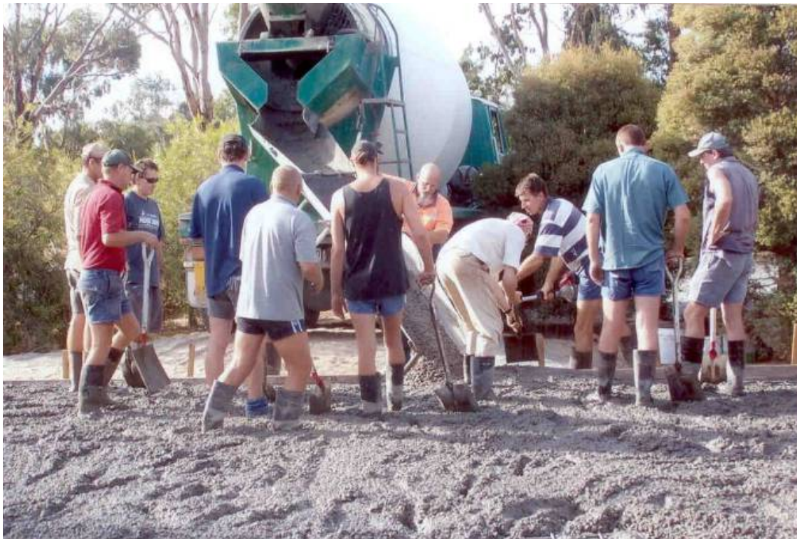
2006 – Construction of the Discover Centre