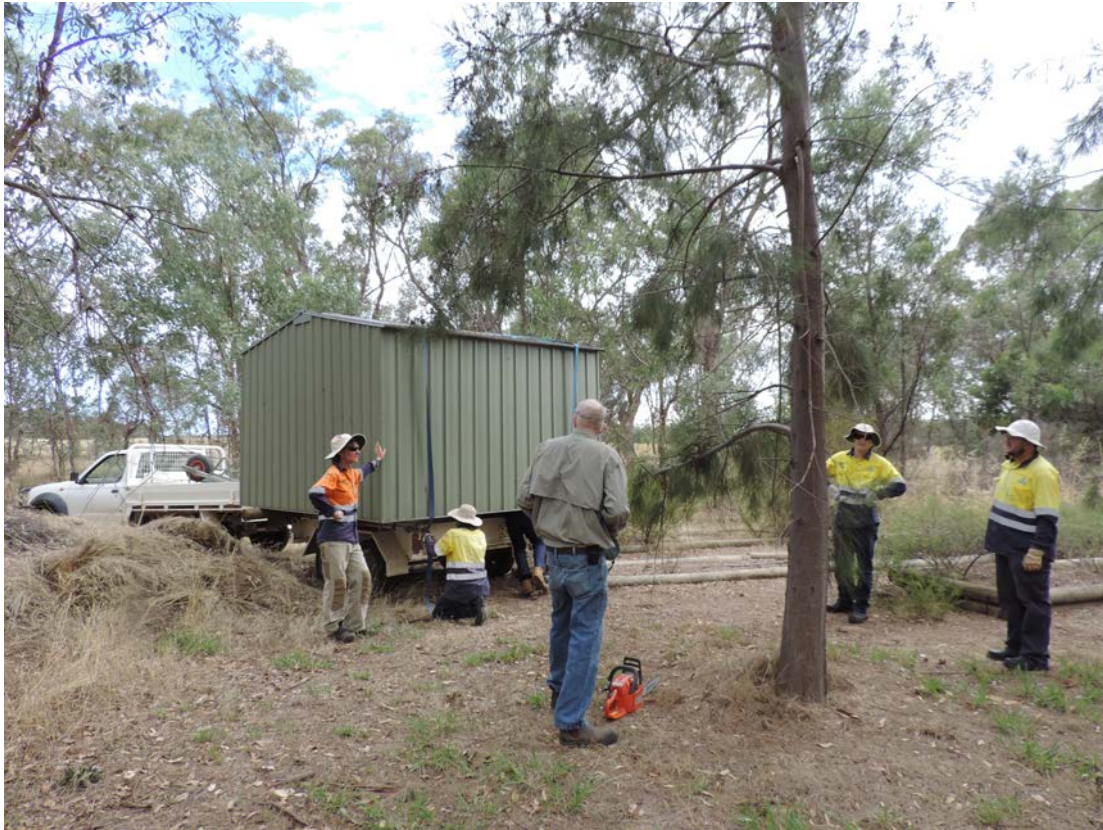
January 2015 – Building new shed