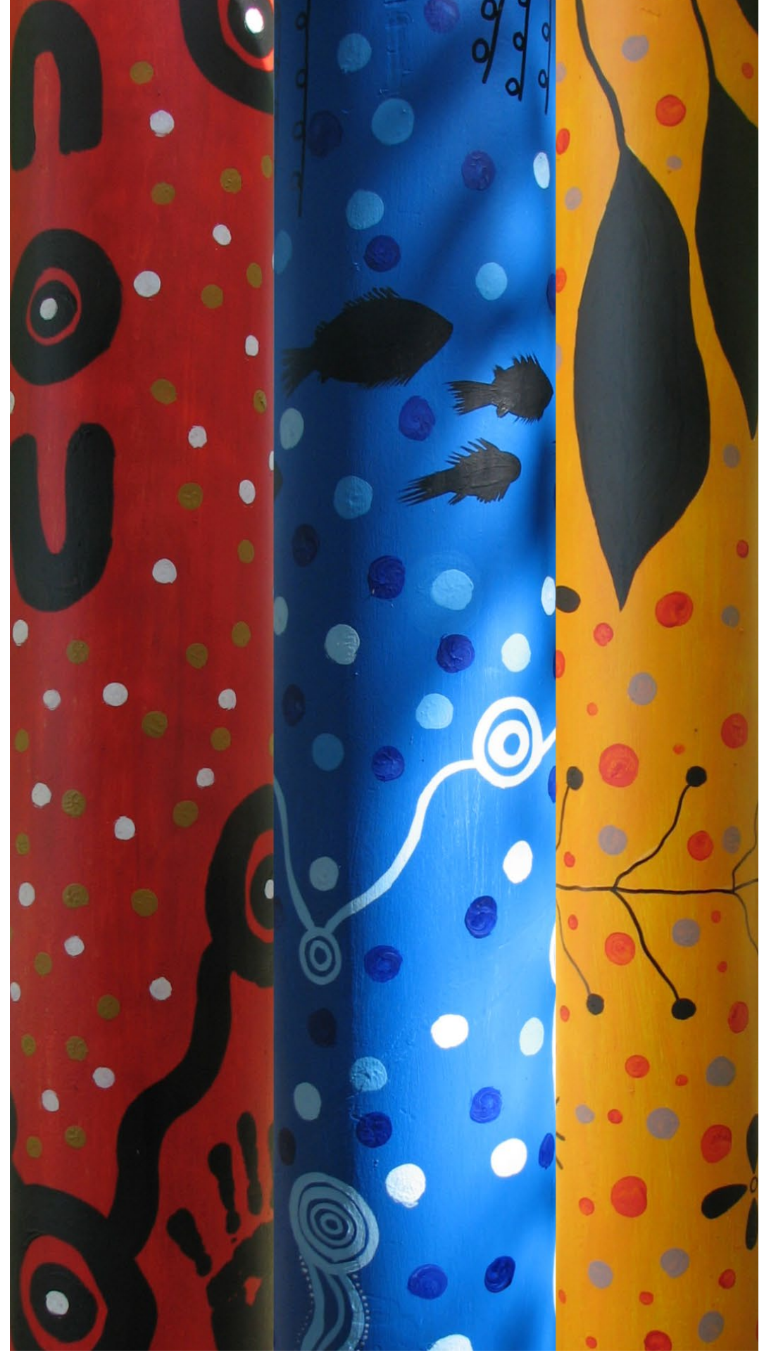
This publication has been produced by Burrumbuttock Preschool with support from Wirraminna Environmental Education Centre and PeeKdesigns.