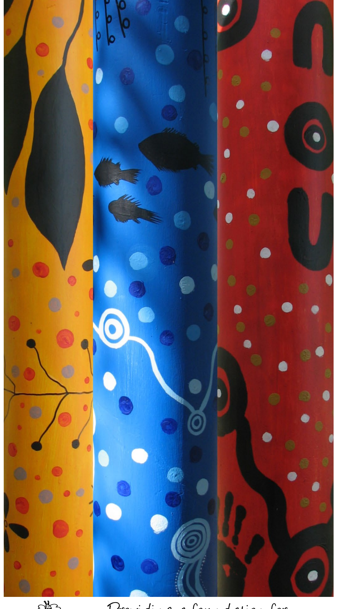
Providing a foundation for lifelong education and learning